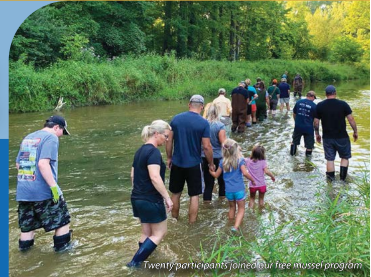
Twenty participants joined our free mussel program

MI Paddle Stewards is an invasive species training program and on Aug 10 our event trained 25 paddlers on how to recognize and report aquatic invasive species. Assistance and funding was provided by Michigan Invasive Species Grant, Michigan Sea Grant, Blueways of St. Clair and Lake St. Clair Cooperative Invasive Species Management Area.