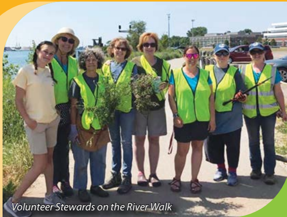
Volunteer Stewards on the River Walk

Our volunteers and community invested in learning, sharing, and in hands-on fieldwork taking care of our environment. Volunteer work included leading tours for school field trips, monitoring and managing native and invasive plant species, habitat field days, citizen science monitoring, trash pick-up and nature walks.