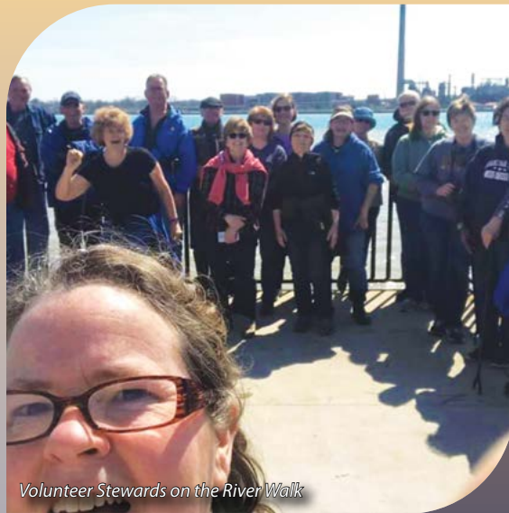
Volunteer Stewards on the River Walk

We collaborated with MSU Extension to bring the Michigan Conservation Stewards program to St. Clair County for the first time. Twenty participants spent seven weeks in the classroom, online and in the field, and each contributed 40 hours of conservation-related community service to complete their certification. The Michigan Conservation Stewards program is a volunteer training program to teach science-based ecosystem management principles to help restore and conserve Michigan ecosystems. Congratulations graduates!