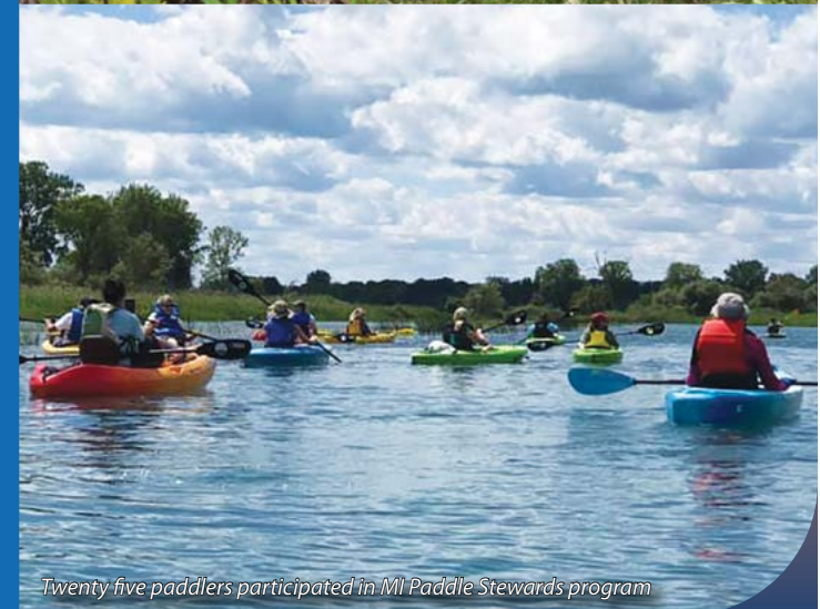
Twenty five paddlers participated in MI Paddle Stewards program