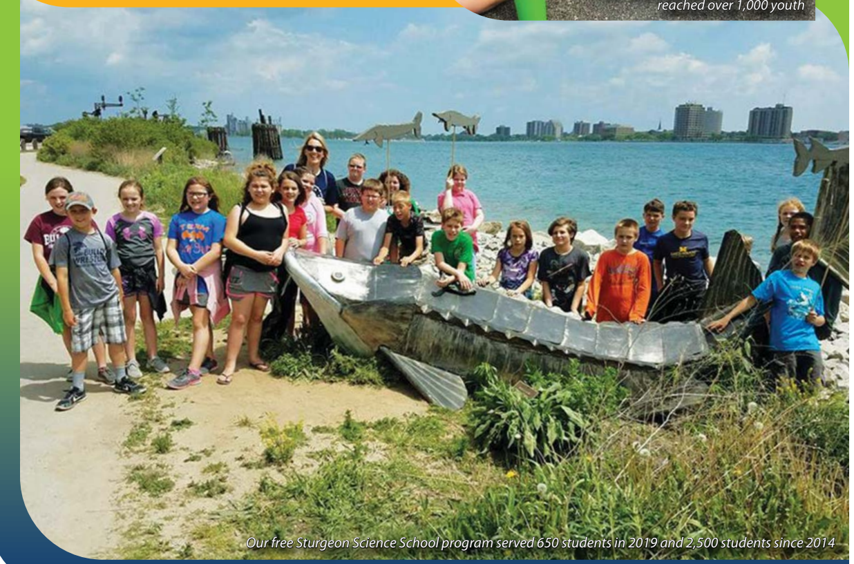
Our free Sturgeon Science School program served 650 students in 2019 and 2,500 students since 2014