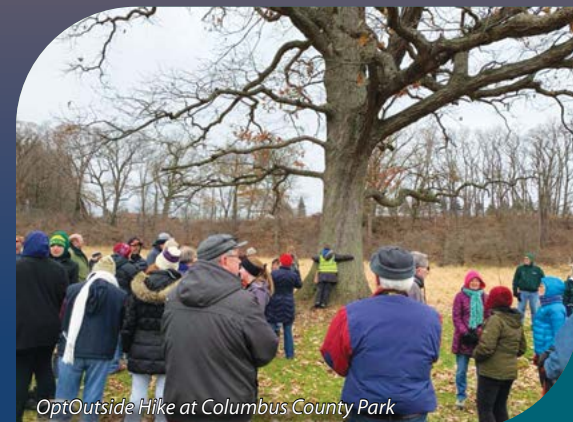
OptOutside Hike at Columbus County Park