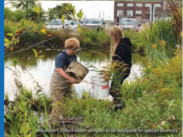
Volunteers collect water samples to be analyzed for species diversity