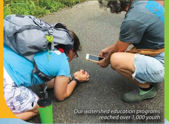
Our watershed education programs reached over 1,000 youth