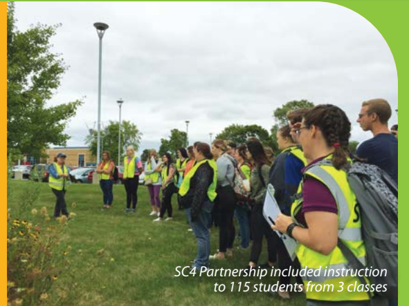
SC4 Partnership included instruction to 115 students from 3 classes

Our custom Lake Sturgeon classroom program brings place-based education into 5th grade classrooms by delivering Lake Sturgeon content directly from biologists to explain their research and local importance.