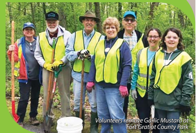
Volunteers remove Garlic Mustard at Fort Gratiot County Park

We cooperated with the Lake St. Clair CISMA, under the umbrella of Six Rivers Land Conservancy, for invasive species monitoring, training, reporting, and management. Our partnership with Lake St. Clair CISMA helps us stay current on the latest research, best practices, and emerging issues in invasive species management.