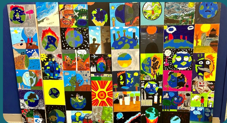
Capstone Project: Be The Change For Climate Change Forty-eight individual canvases are mounted onto eight boards, that when assembled together, create a collage that communicates messages about climate change.

A St. Clair River Middle School Art teacher and Environmental Science teacher collaborated to address the 8th grade Climate Change unit. Class time was provided to work on the murals, the school provided art supplies and guided painting techniques, and Friends provided the canvases. Students were challenged to communicate their thoughts, feelings or facts about climate change on their own canvas. Each canvas was connected into one large art piece.